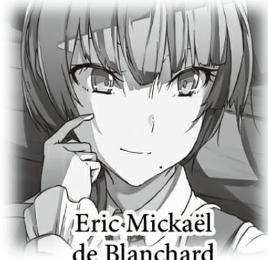
Eric Mickaël de Blanchard

Revered as an accomplished general, he was driven to the border by those envious of his achievements. He would spend his days as the de facto commander of Fort Sierck drinking and gambling, but he surrendered this position when Altina bested him in a duel.