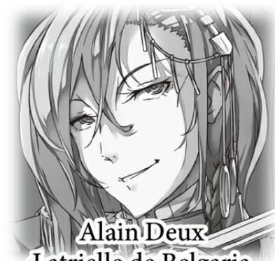
Alain Deux Latrielle de Belgaria

Third prince of the Belgian Empire. Detesting the very notion of getting involved in power struggles, he left Belgaria to study in High Britannia. Frustrated that his siblings were being handed treasured swords left and right, he may or may not have secretly made off with the Vite Espace Trois.