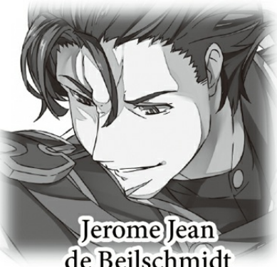
Jerome Jean de Beilschmidt

A maid six years older than Altina who has been by the princess's side for as long as she can remember. Altina trusts her from the depths of her heart. While Clarisse is usually silent like a doll, she tends to joke incessantly with anyone she's taken a liking to.