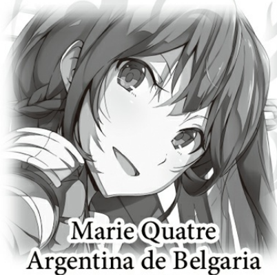
Marie Quatre Argentina de Belgaria

Fourth princess of the Belgian Empire. She was named after her mother's homeland of Argentina, and is known as "Altina" for short. Boasting red hair and crimson eyes, she swings around the Grand Tonnerre Quatre, a sword even taller than she is. She has resolved to try and become the next empress for the sake of those suffering under the Empire's tyranny.