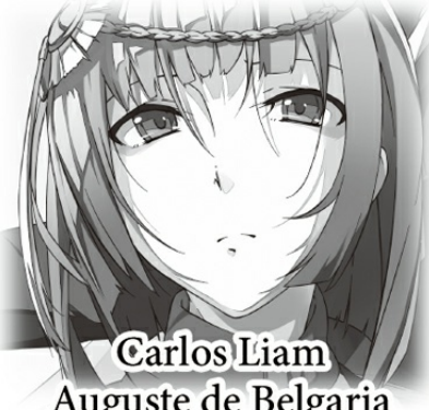
Carlos Liam Auguste de Belgaria

A Belgian knight and the grandson of Everard. While serving in Marquis Thénézy's army, he was deeply impressed by Regis's command, and personally volunteered to be sent to the front lines to chase after the man he respected so much.