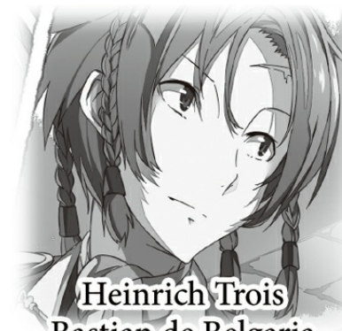
Heinrich Trois Bastian de Belgaria

First-grade combat officer. The new head of the House of Balzac, famous for its outstanding swordsmanship. Despite having inherited his house's aptitude for swordplay, Eddie has never cut down a person on the battlefield. The sword he carries, the Défendre Sept, has been passed down in his family since the days of the first emperor.