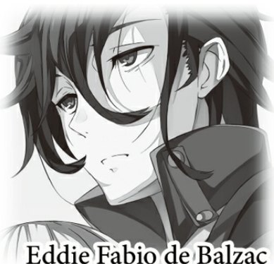
Eddie Fabio de Balzac

First prince of the Belgian Empire. While being first in line to the throne, he was sickly from birth. After coughing up blood and collapsing following a banquet, he disappeared from the public eye for an extended period of time, but has since made his return.